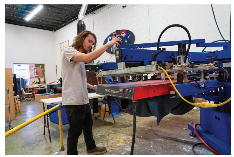
A loan from Forge helped Electric Ghost scale up its screen printing business.

This option gives us two ways to make a difference in Arkansas. Now, we can benefit our community through both grants and investments.