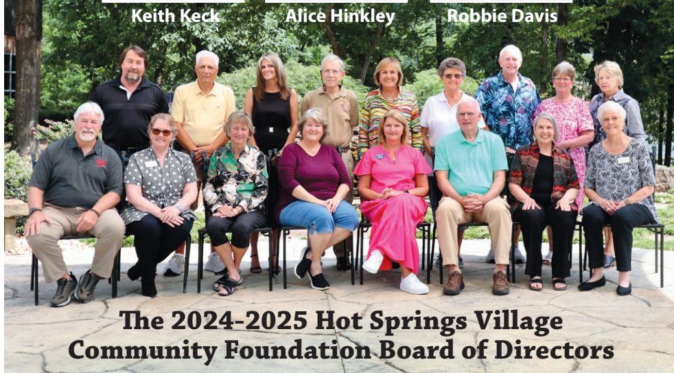
The 2024-2025 Hot Springs Village Community Foundation Board of Directors