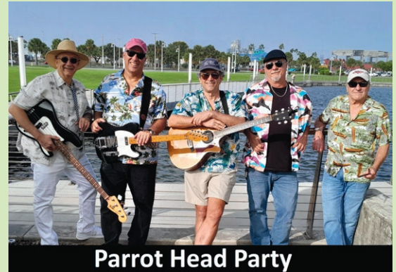
Parrot Head Party