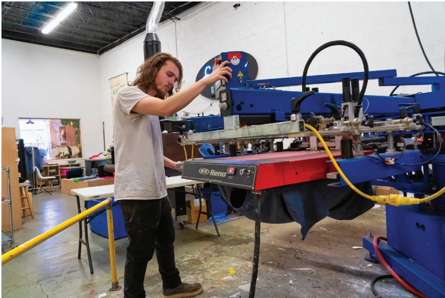
A loan from Forge helped Electric Ghost scale up its screen printing business.

This option gives us two ways to make a difference in Arkansas. Now, we can benefit our community through both grants and investments.