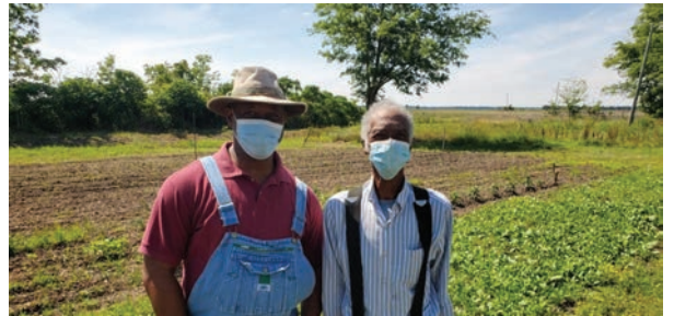
Zenenvirotech is always looking for volunteers to assist with helping build gardens and community spaces to grow food.