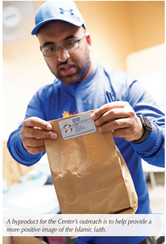
A byproduct for the Center’s outreach is to help provide a more positive image of the Islamic faith.

Many lessons were learned along the way as the Center began distribution. “If you can’t afford food, you probably can’t afford many other things,” said one volunteer at the Center.