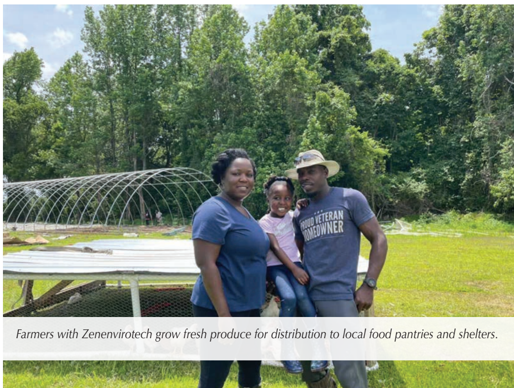
Farmers with Zenenvirotech grow fresh produce for distribution to local food pantries and shelters.

The COVID-19 pandemic exposed fragilities in our local food system.