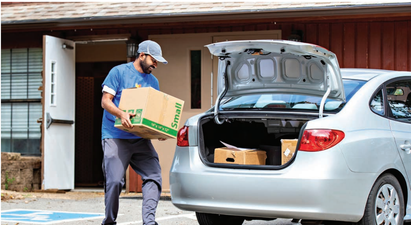
The Center received a grant from Arkansas Community Foundation’s COVID-19 Relief Fund in 2020 to help buy a refrigerator and freezer. This purchase allowed the Center to offer fresh food like meats and produce.