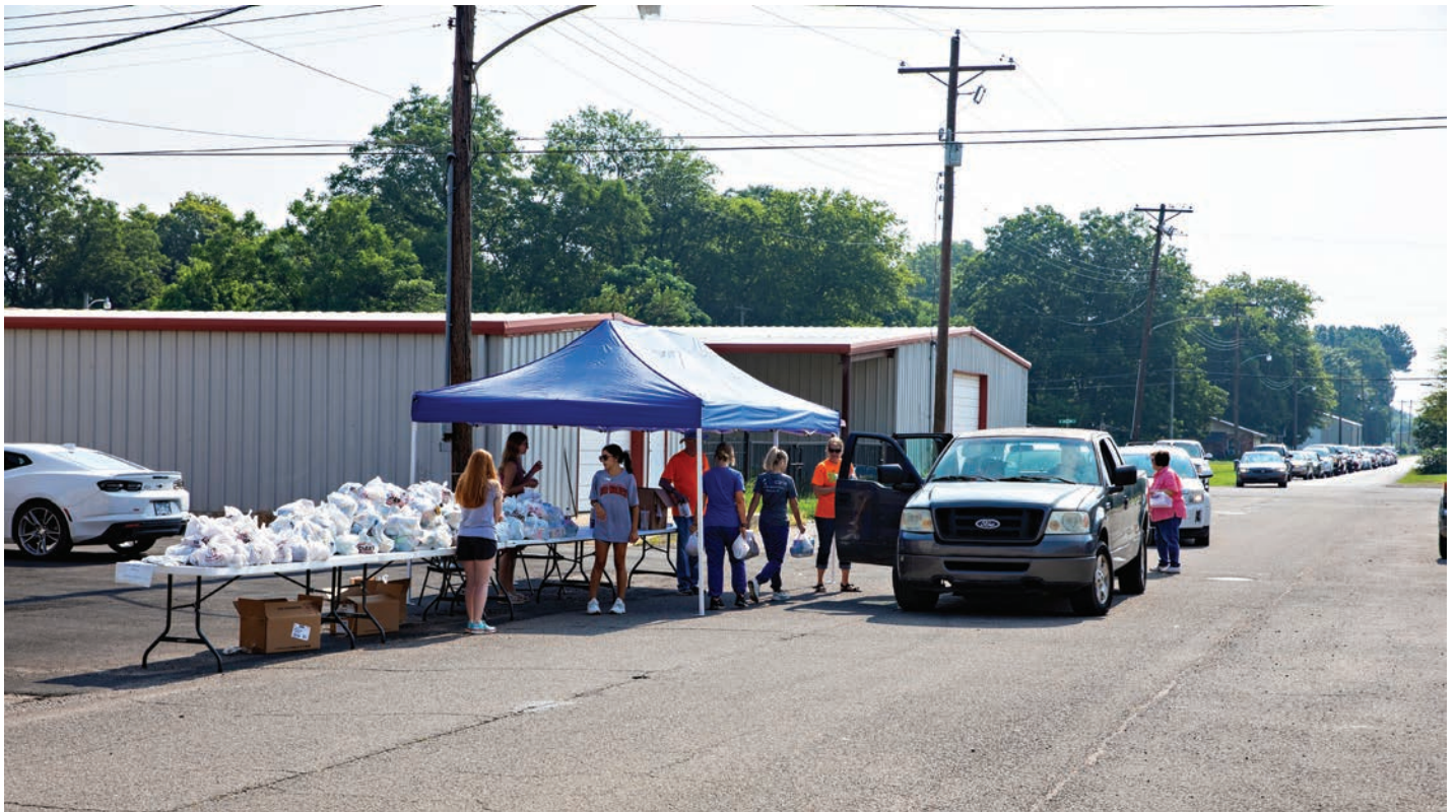
Volunteers help package and distribute food from The Warehouse in McCrory.