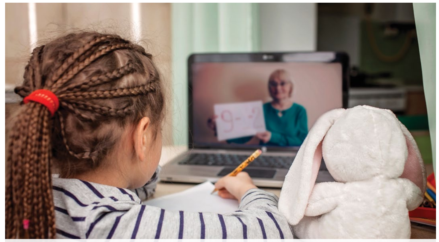
When schools closed, Parent Mentor Program members at Eudora Elementary were a bridge between families and the information and resources they needed to stay healthy and be involved with their community.

"Never doubt that a small group of thoughtful, committed citizens can change the world; indeed, it's the only thing that ever has."