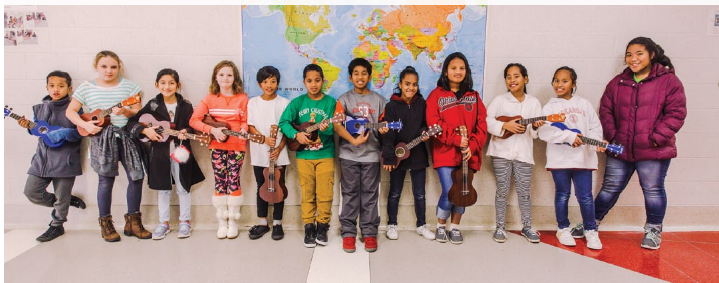
Music can help students learn about diverse cultures found in Arkansas classrooms.

Creating thoughtful and innovative partnerships with schools, local arts organization and community leaders can provide access to enriching arts-based opportunities for a child into adulthood. Utilizing the arts as a viable tool for student engagement allows for development of technical and practical skills considered instrumental in academic and career success.