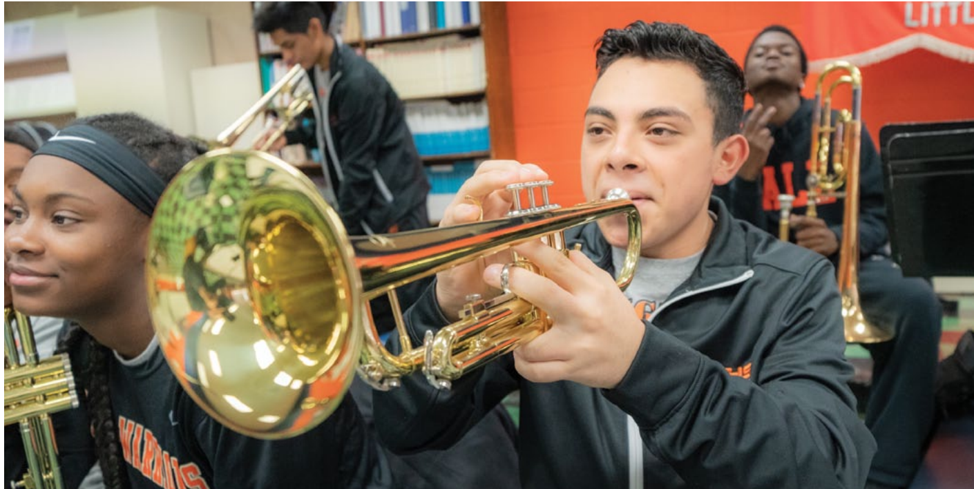
Since 2007, the Thea Foundation has provided more than $1.5 million to supplement underfunded arts programming in Arkansas schools.