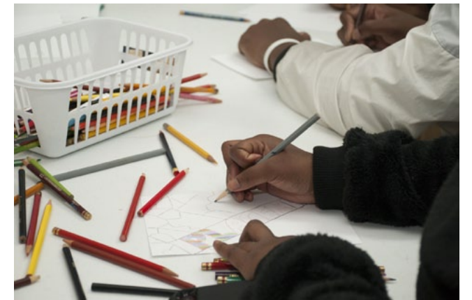
Students from Dollarway High School traveled to the Arts and Science Center for Southeast Arkansas in Pine Bluff recently as part of an effort by their school and the Arts Center to boost their literacy skills. They analyzed artwork and chose one word to describe a piece on display that caught their attention. Then they created an artistic interpretation of their own using the word they chose.