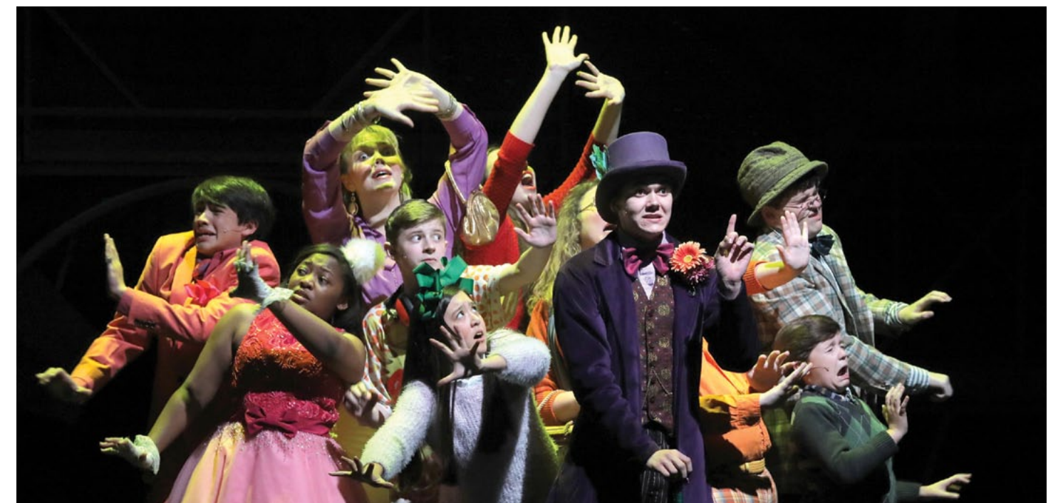
Student performers bring a scene from "Willy Wonka Jr." based on the Roald Dahl children's classic to life for audiences at Arkansas Repertory Theatre.

"The key to integrating arts into education lies in