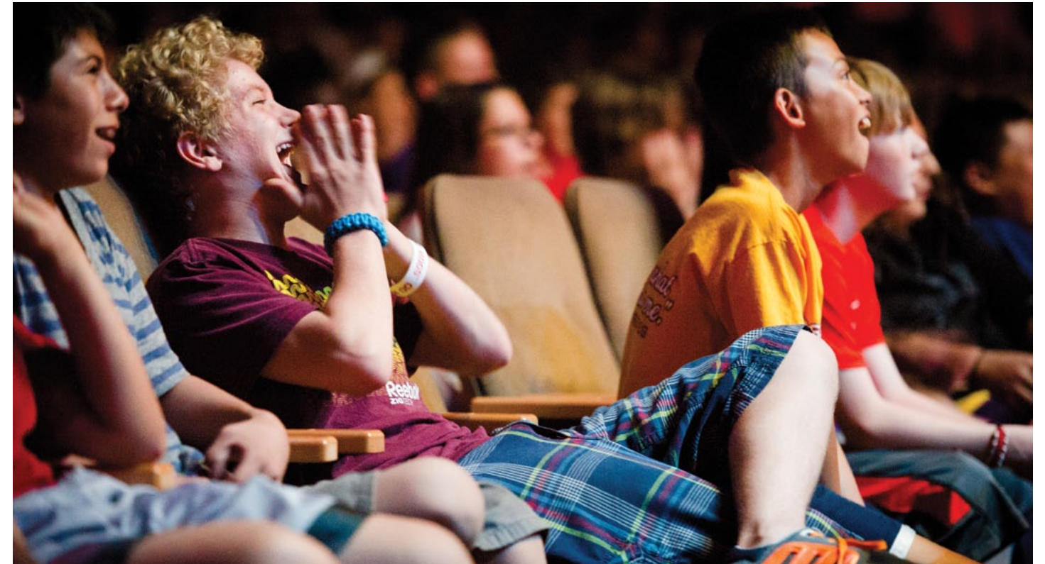
Walton Arts Center in Fayetteville brings in approximately 30,000 students annually as part of its educational outreach field trip program.