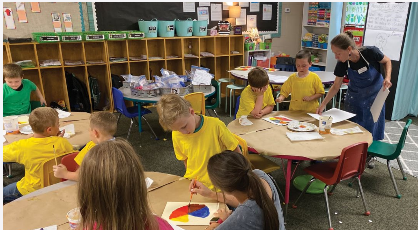
Mountain Pine Elementary students create paintings as a part of the Arkansas Learning Through the Arts Program curriculum integrating arts into the classroom learning experience.