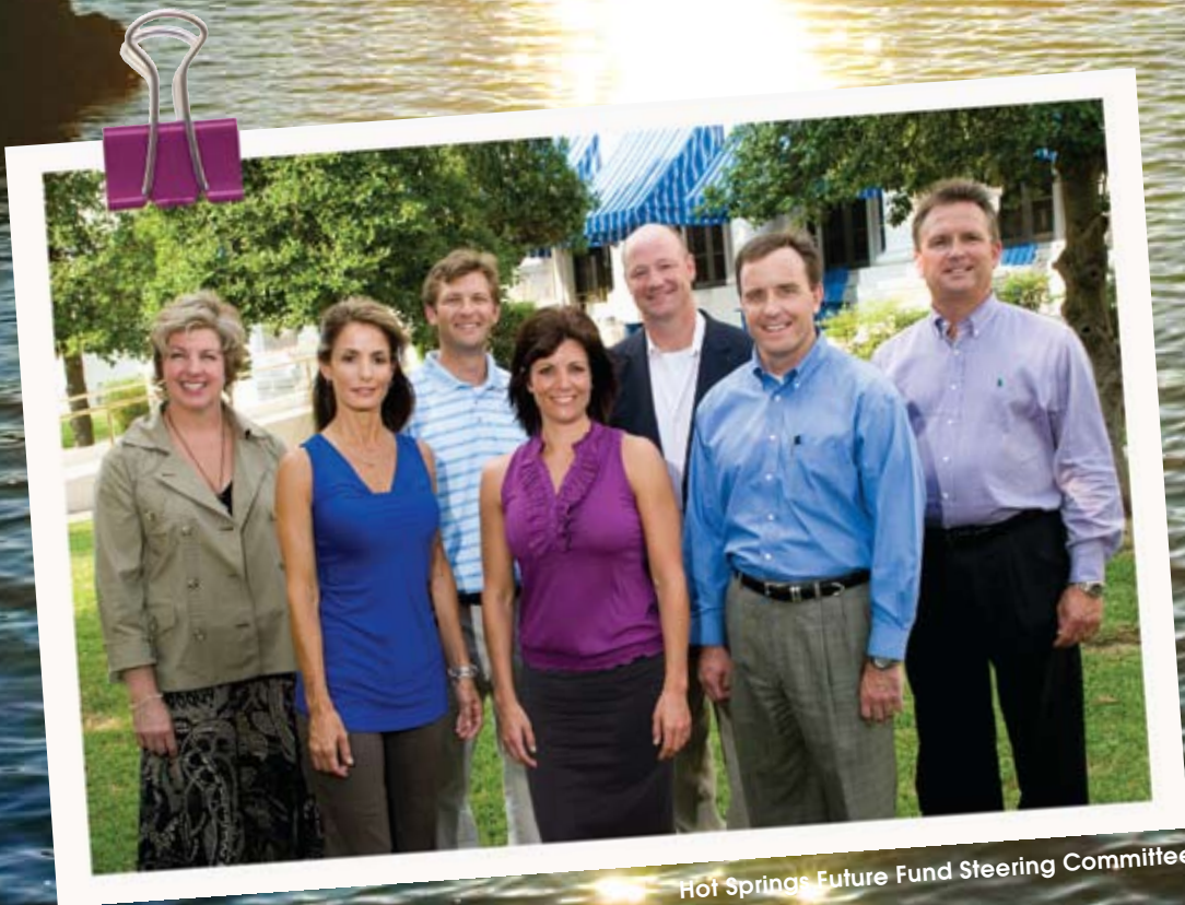
Hot Springs Future Fund Steering Committee